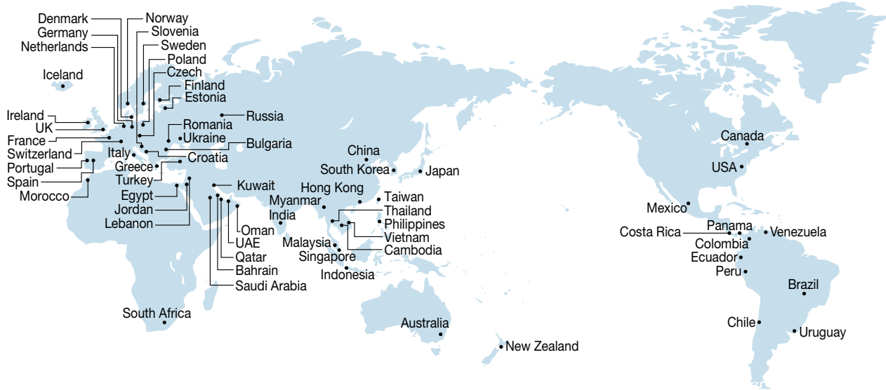
As of March, 2019