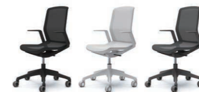
Black White Dark Grey