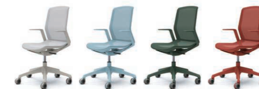
Light Greige Sage Dark Green Orange Red