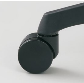
Normal Caster (Soft Casters, Hard Casters)