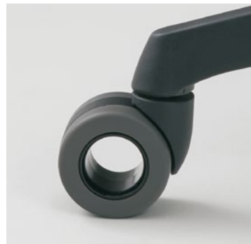
Hollow Caster (Soft Casters only)