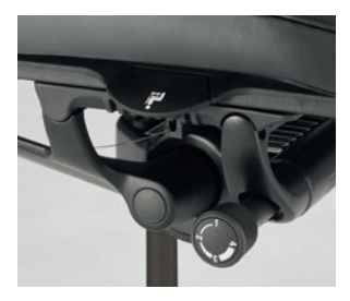
Reclining Tension Adjustment

Adjust the chair height, within a range of 17 3/8\ensuremath{\text{"(441mm)}} to 21 3/4\ensuremath{\text{"(55lmm)}}, using the lever in the right armrest. Adjustment of the seat's depth, within a range of 2"(50mm), is available using the levers beneath the seat.