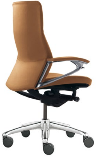
The fully upholstered leather executive chair is a timeless classic. Legender is a modern take on the concept complete with detailing options including design stitching and gradient perforation.