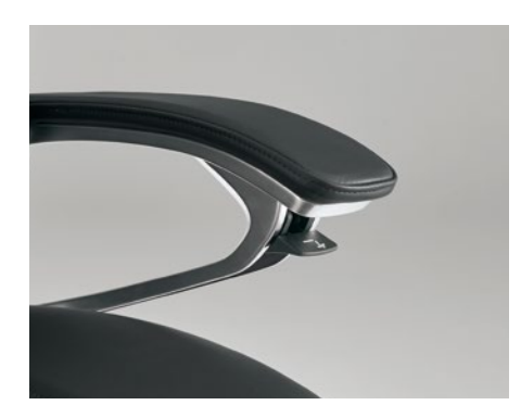
Smart Operation Mechanism

Designed to fit your body, and your style. Features include Smart Operation with height adjustment and reclining lock at your fingertips, responsive seat slide and