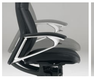
Seat Height and Depth Adjustment

Okamura's unique Multiple Density Cushion utilizes three types of urethane foam, of varying firmness layered together, to promote healthy sitting. The cushion provides softer support at the front of the seat, reducing pressure on the thighs for improved circulation; denser cushioning at the back firmly supports the hips for stability and improved posture.