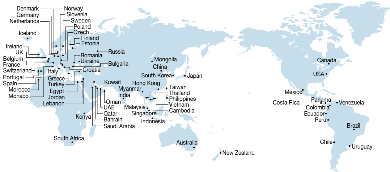
As of March, 2020