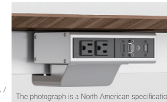
Power charger / HDMI / VGA / AUDIO / USB / RJ11 / RJ45

Integrated technology is concealed within each design, allowing for future flexibility. As technology tools advance toward wireless offices, V conference table locates power and data in its Tech Cradle—a small connective box discreetly tucked under the tabletop. Cables are hidden inside the legs, ensuring a polished look and more usable space.