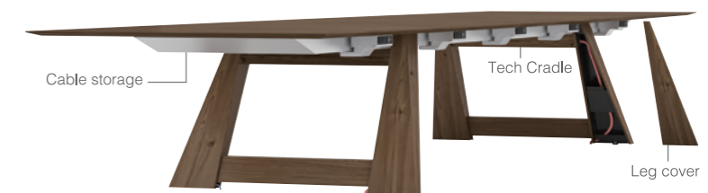
The photograph is a North American specification.

The minimal silhouette of V conference table is achieved through a simple, canted leg design mirrored on either side of the table.