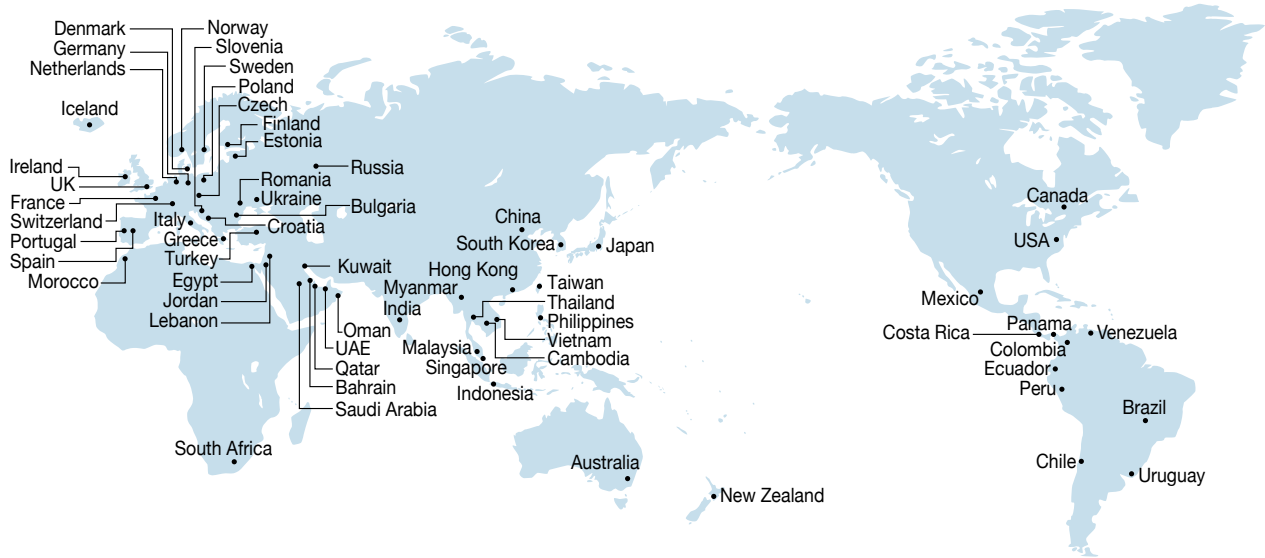
As of March, 2022