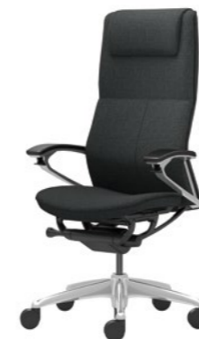
Extra High back