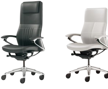
Extra High back High back